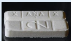
Real Xanax Pills

Street names: 30s; 40s, 512s, Beans, Blues, Buttons, Cotton, Greens, Hillbilly Heroin, Kickers, Killers, Muchachas, Mujeres, OC, Oxy, Oxy 80s, Roxy, Roxy Shorts, Whites