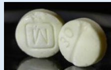
Fake Oxycodone Pills