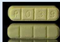
Fake Xanax Pills