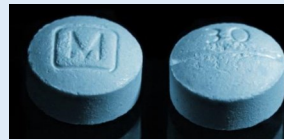
Real Oxycodone Pills