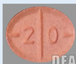
Fake Adderall Pills