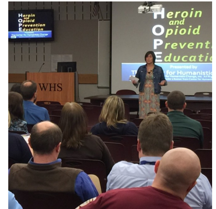
Community HOPE Presentation

HOPE has been delivered to 9,993 community members this year (a 64% increase over the previous year) through school and community presentations. Nearly 2580 teachers, adult community members, and professionals (18 or older) participated in this presentation. All other participants were high school students. To book the program for your group, please call the Center at 610-443-1595. Steps are underway to develop a follow-up program, HOPE II, focusing on intervention, treatment and after-care.