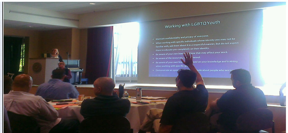
Student Assistance Program Consortium

This year CHC expanded Student Assistance Program (SAP) services from 71 to 85 schools where we provide liaison services, technical assistance, material dissemination, newsletters, team maintenance, and evaluation services. Our Commonwealth Approved Trainer certified 135 new SAP professionals. Fifty-two of these people are from elementary schools, and are now utilizing their new skills to identify and remove barriers to learning and school success K-5. The number of educational opportunities we offered to the SAP community increased from two to three with 150 total attendees. Twenty-four people attended the first ever Lehigh County After-School Elementary SAP Consortium. We are very proud that one of the SAP teams we serve, Whitehall High School, was voted the 2016 “Best SAP Team in Pennsylvania.”